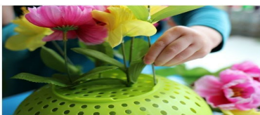
fine motor tray spring flowers

Provide children pipe cleaners, glue and color construction paper and food drainers. Have them create flowers with the construction paper and glue them to the pipe cleaner. Next allow them to place the pipe cleaners in the food drainer and This activity is good for their fine motor skills.